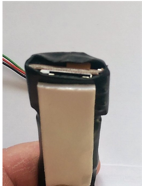
Micro SIM slot