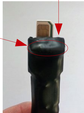
View from top